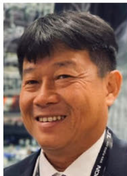
Passport-style photograph (jpeg format)