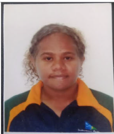
Passport-style photograph (jpeg format)